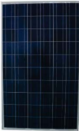
High Efficiency PV Modules